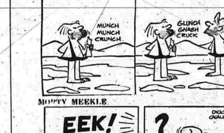
MOPPY MEEKLE BY JOHNNY HART